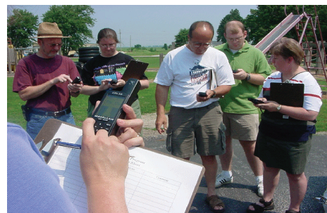
Fulton County & Dickson Mounds